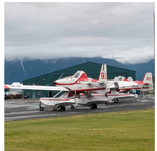
Fire Bosses parked at Palmer Airport on Monday, June 21.